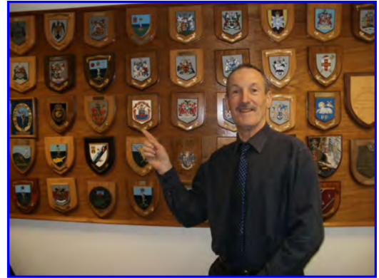
The RSA Admin Officer in his office with his collection of RSA and Association Branch shields

Membership. There were 1184 new Life Members enrolled during 2011. Of these, 542 were young soldiers starting their initial trade trg at Blandford. The Army Personnel Centre (APC) notifies RHQ of an average of 45 soldiers leaving each month and the Chairman RSA writes to them at their last unit - the total of those accepting the offer of Life Membership in 2011 was 41. Officers are automatically enrolled upon notification of their retirement and there were 40 during the year. A further 10 officers were enrolled at the start of their Tp Comds course. There were numerous cases during the year of contact being re-established with members from whom we hadn't heard for many years (1950s and 60s in some instances). The total number of members on the database now stands at over 18,500. However of these there are several hundred with whom we have lost contact as they have moved without informing us of their new address.